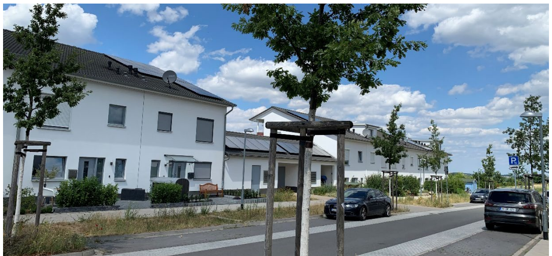
Photo Credit: Kamal, A. (2022); Kronsberg District, Hannover, Germany.

Uses case studies to examine how sustainability can be achieved in the built environment, from choosing materials and finishes to patterns of regional land use.