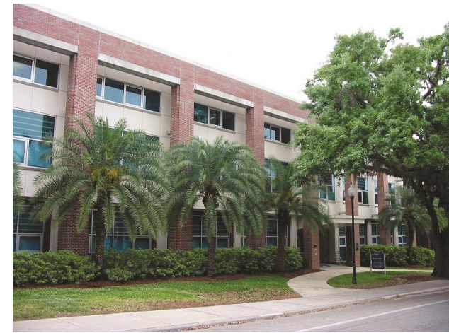
Study in Rinker Hall, the first LEED certified building on the UF campus and the State of Florida.

March 1—Fall semester September 1—Spring semester