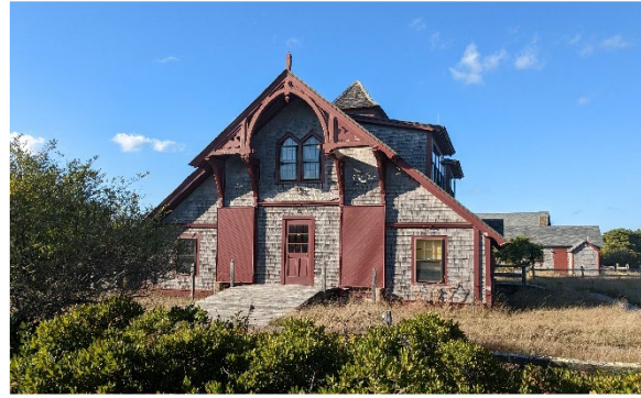
Surfside Life-Saving Station/Star of the Sea Youth Hostel (1874) has been the subject of PIN research for students in 1978, 2006, and 2022.