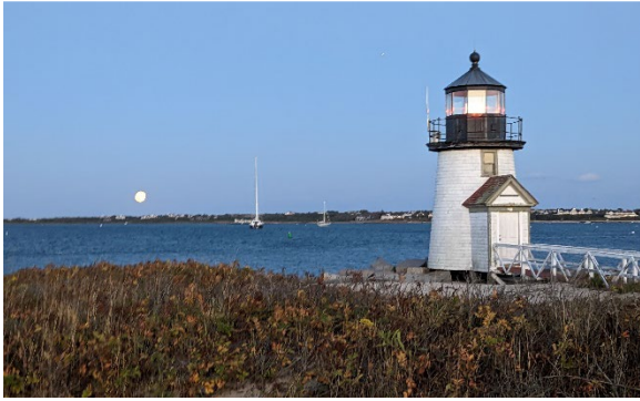
Brant Point Lighthouse (1900) was documented by participants in the Preservation Institute Nantucket in 1998.