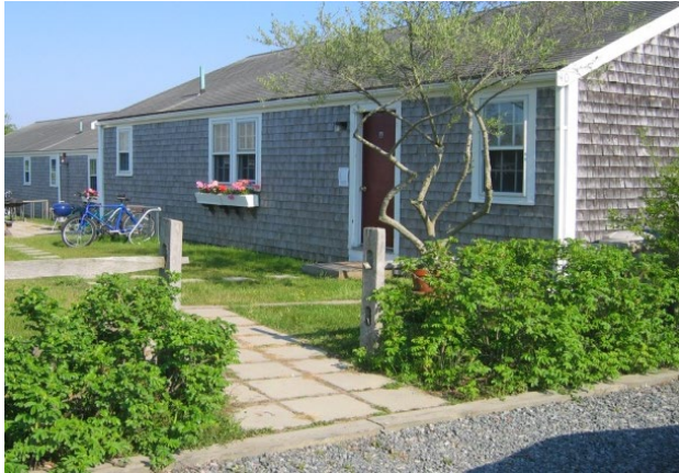
PIN Dormitories on Nantucket

Students are housed in a University of Florida-owned dormitory, located a twenty-minute walk from the academic studio. Each student will have their own room with twin bed and shared common areas with on-site laundry. Wireless internet is provided in the dormitories. Housing costs for the program are included in the fee.