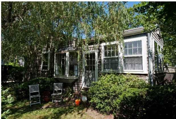
PIN Cottages on Nantucket

Faculty and Guest Lecturers are housed in the PIN cottages in town. PIN group dinners may be hosted in the Cottages yard as announced by the Director.