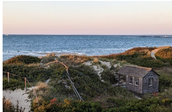
View of North Shore beach from Steps Beach.