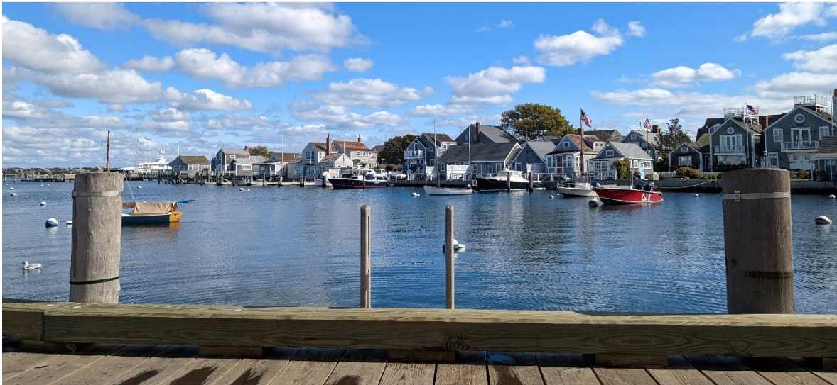
View of Nantucket Harbor, steps away from the downtown PIN studio.