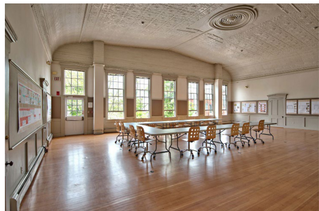
PIN Studio at Sherburne Hall – Exterior and Interior Views